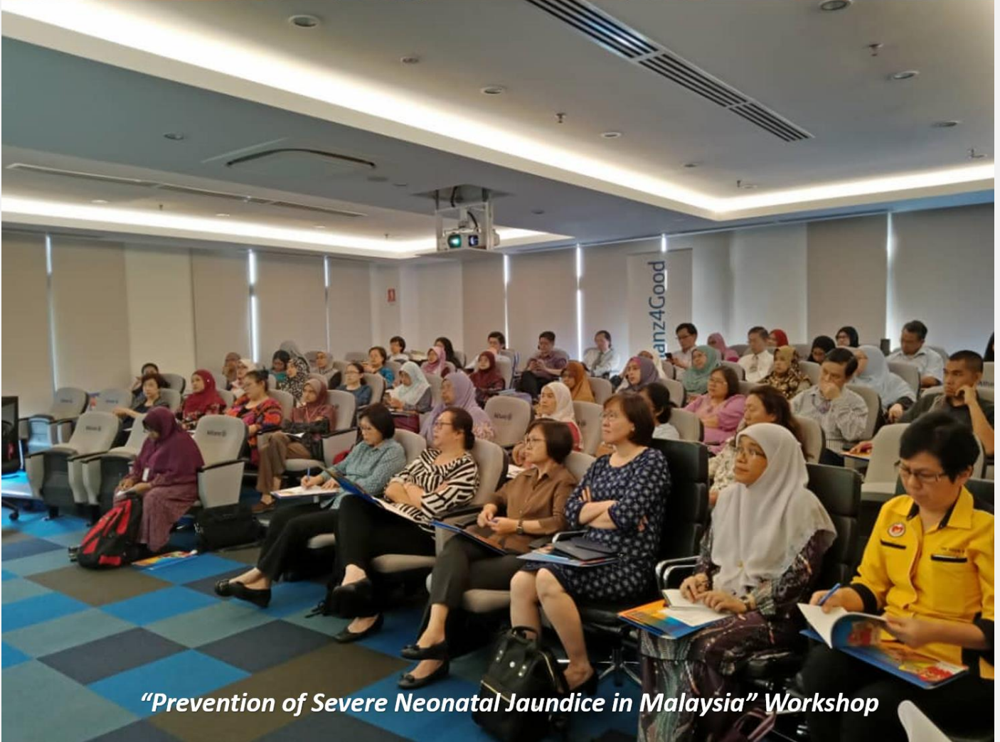
"Prevention of Severe Neonatal Jaundice in Malaysia" Workshop