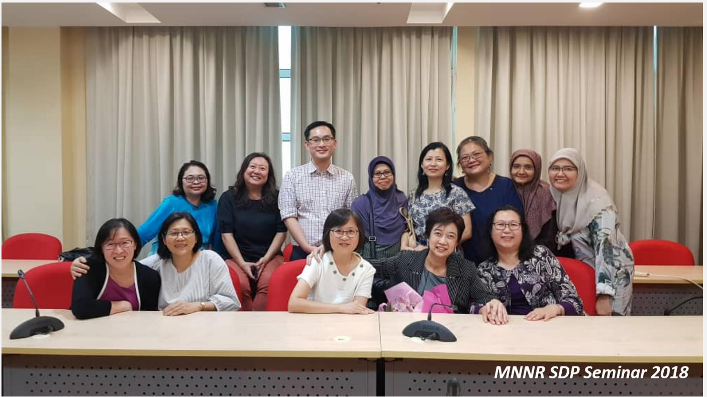
MNNR SDP Seminar 2018