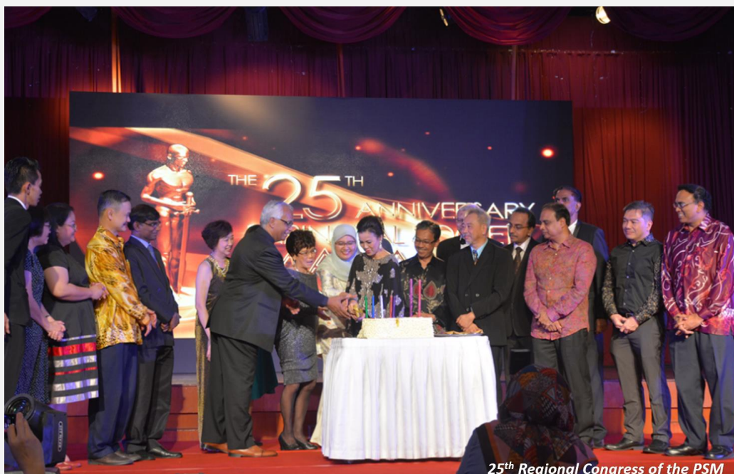
25 th Regional Congress of the PSM

This year congress also marked the Silver Jubilee for the annual event of the Perinatal Society of Malaysia. In order to commemorate with this, the society has invited the Past and Present Presidents of the Perinatal Society of Malaysia for the past 25 years to attend the Congress dinner which was held on 7 th April 2018 at the ballroom of the Royale Chulan Kuala Lumpur. As a token of appreciations for their contributions to our beloved society, they were given a gift each during the event.