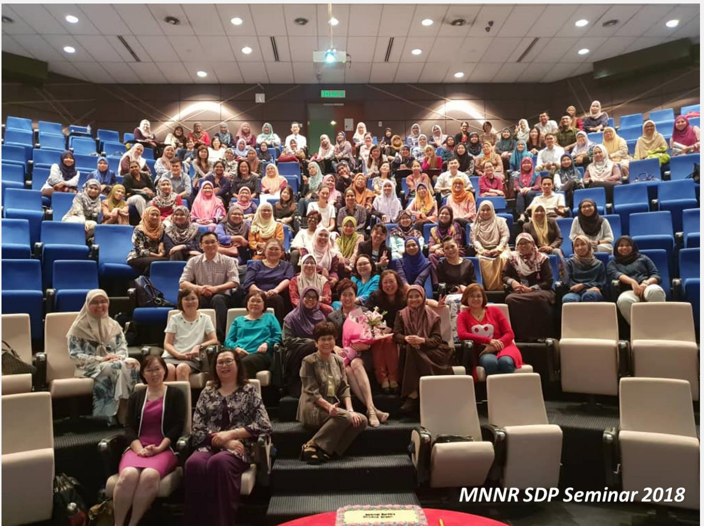
MNNR SDP Seminar 2018