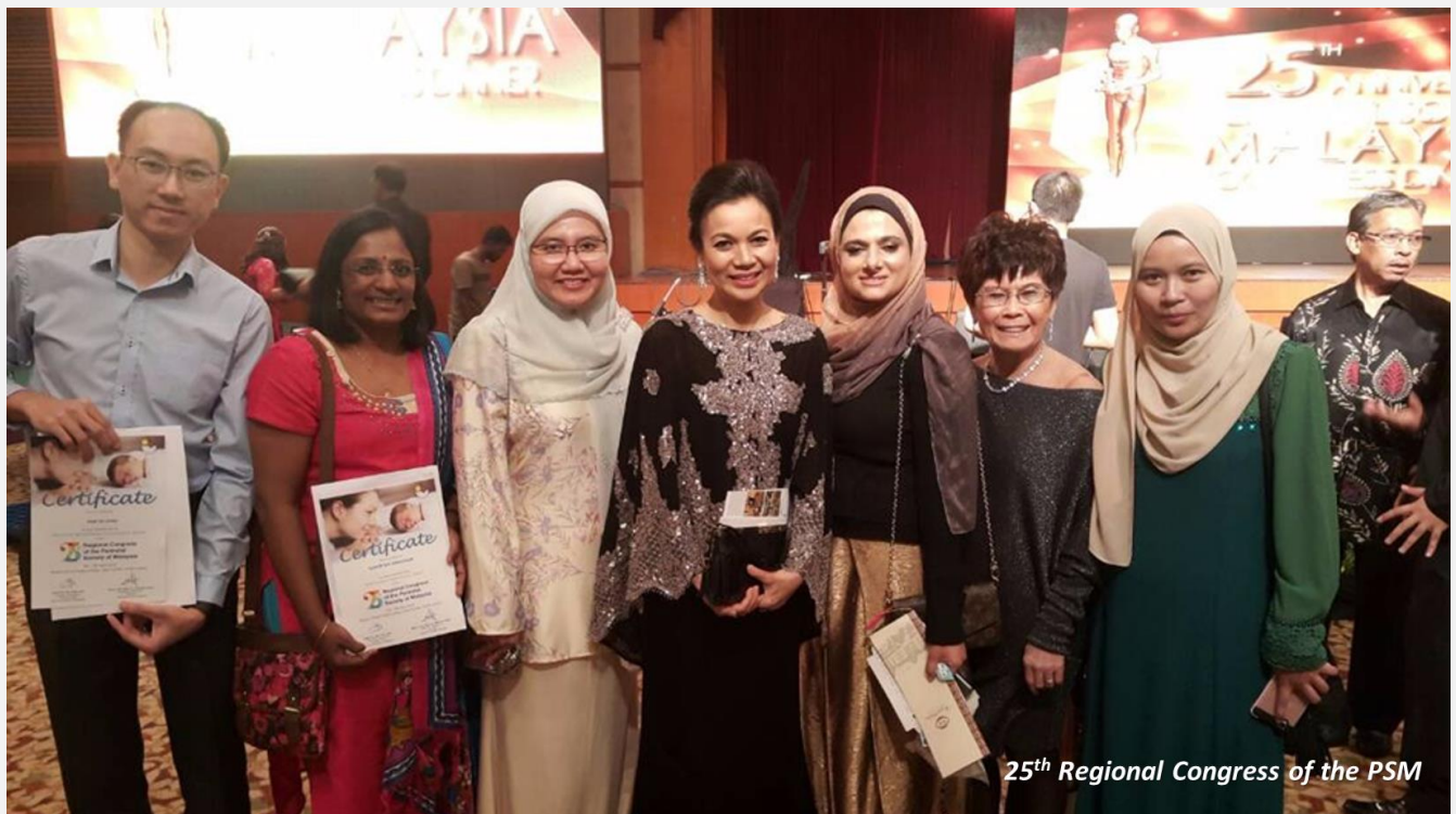
25 th Regional Congress of the PSM